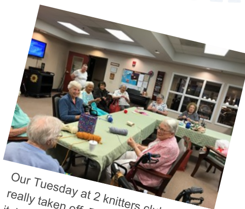
Our Tuesday at 2 knitters club has really taken off. The ladies are loving it. We are working on items for the Operation Christmas Child.