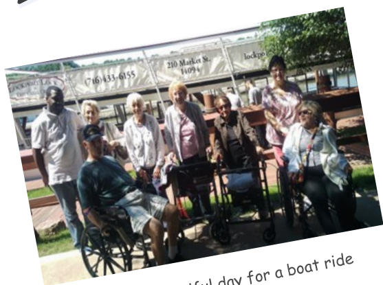
What a beautiful day for a boat ride through the Lockport Locks.