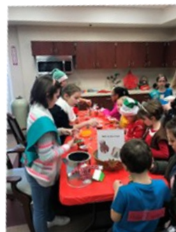
The kids enjoy making and taking a Christmas ornament at our Holiday Open House.