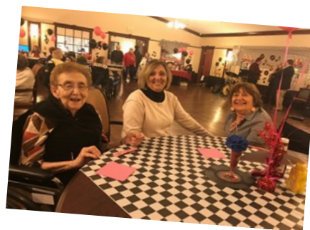
These three look like they're waiting for a good song so they can "rock it"