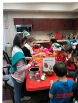
The kids enjoy making and taking a Christmas ornament at our Holiday Open House.