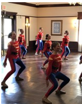
We were lucky enough to have the Karen Kelly dancers back for our Holiday Open House. They were fantastic!