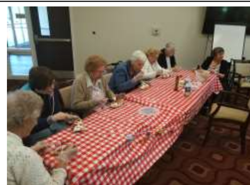
We recently took a trip out to our sister community, Orchard Heights. We were treated for lunch and afterward had a banana split competition. Everyone was a winner!