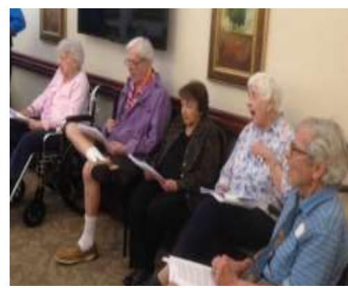
Our Brompton chorus did another fabulous job at our recent concert.