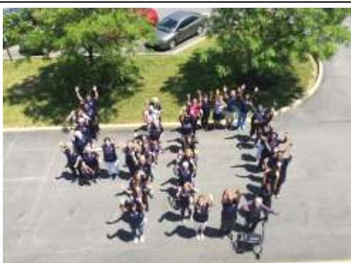
On June 9 th we celebrated the Hamister 40 year birthday. After forming the 4 0 we headed in for cake and music. Congratulations to our corporation. Here's to another 40 years!